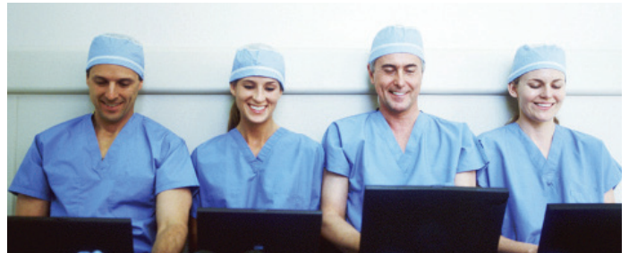
"Digital Doctors" enjoy participating in VCN chats