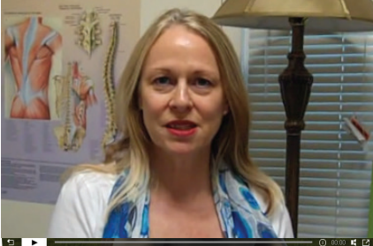
deliverables with integrated video bring insights to life